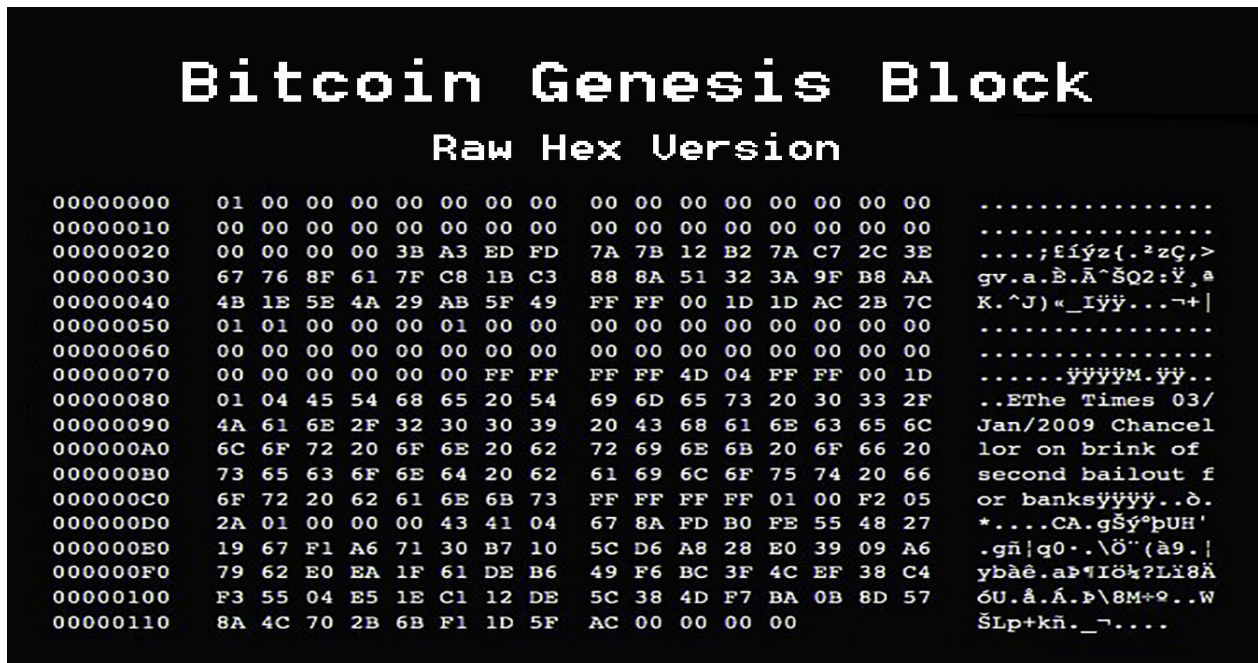
Figure 1: Bitcoin Origin Block

The "Bitcoin Genesis Block" block, Satoshi Nakamoto produced on January 3rd, is the most well-known Genesis block. The 50-bitcoin reward for this block expires after one day. The Genesis Block reward's mining status is unknown, and Satoshi Nakamoto has yet to comment. Below is an image of his block: ("what is Genesis Block and why Genesis Block is needed? | by Tecra Space | Medium," n.d.)